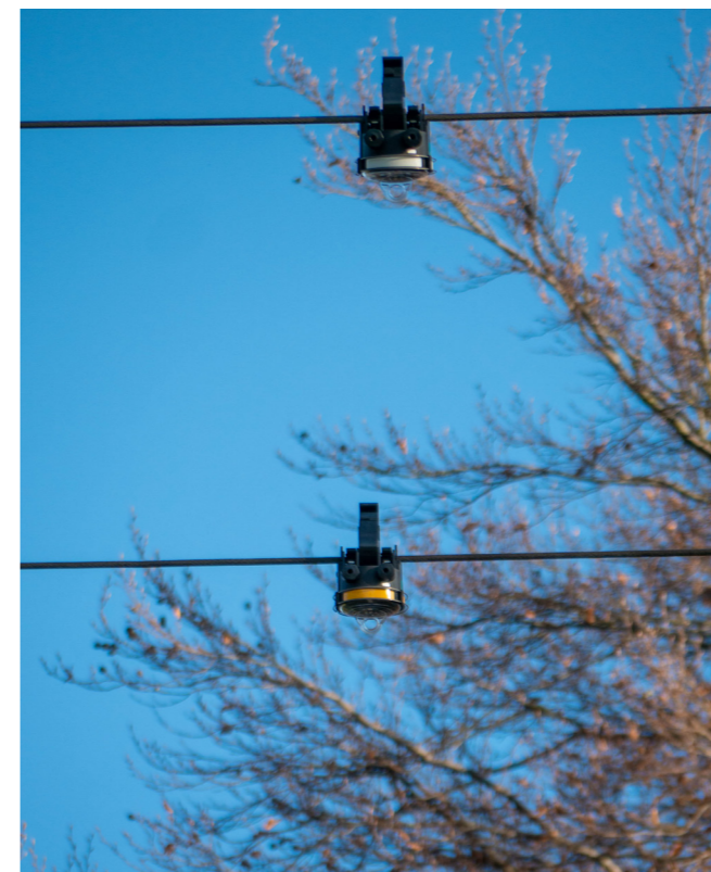
A Smart Navigator 2.0 can be coupled with two satellites to ensure optimum overhead line monitoring.